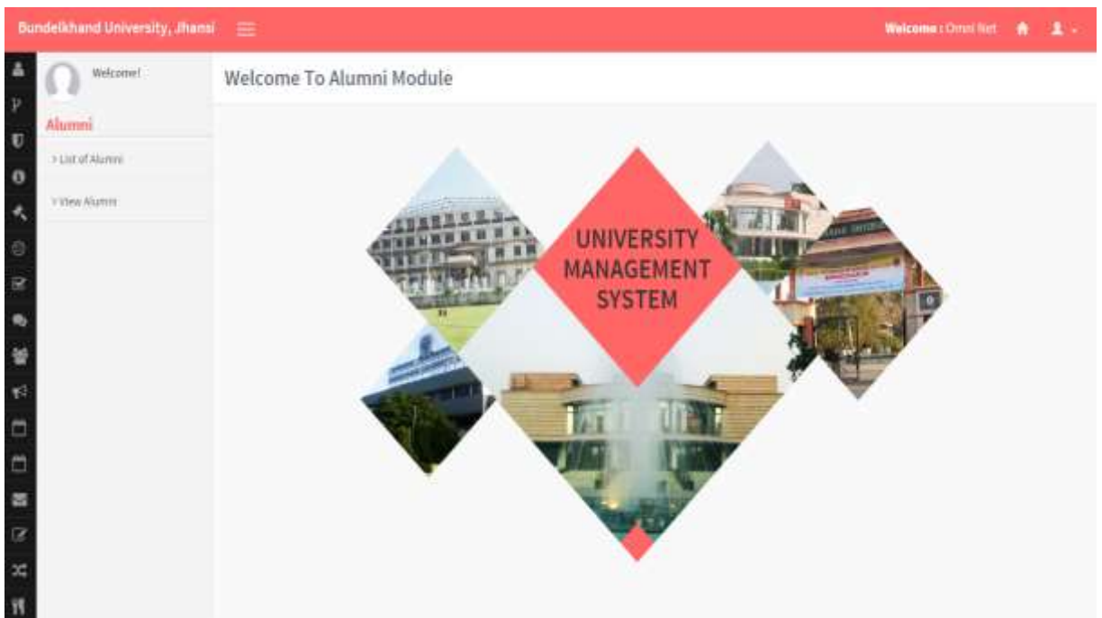
Image: Welcome Page