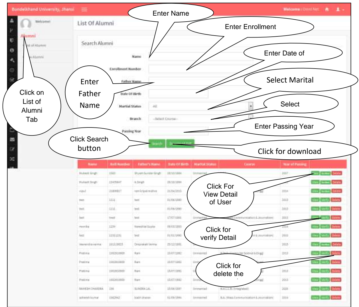
Image: List of Alumni