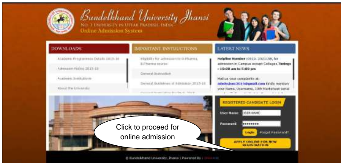
Image: Welcome Page