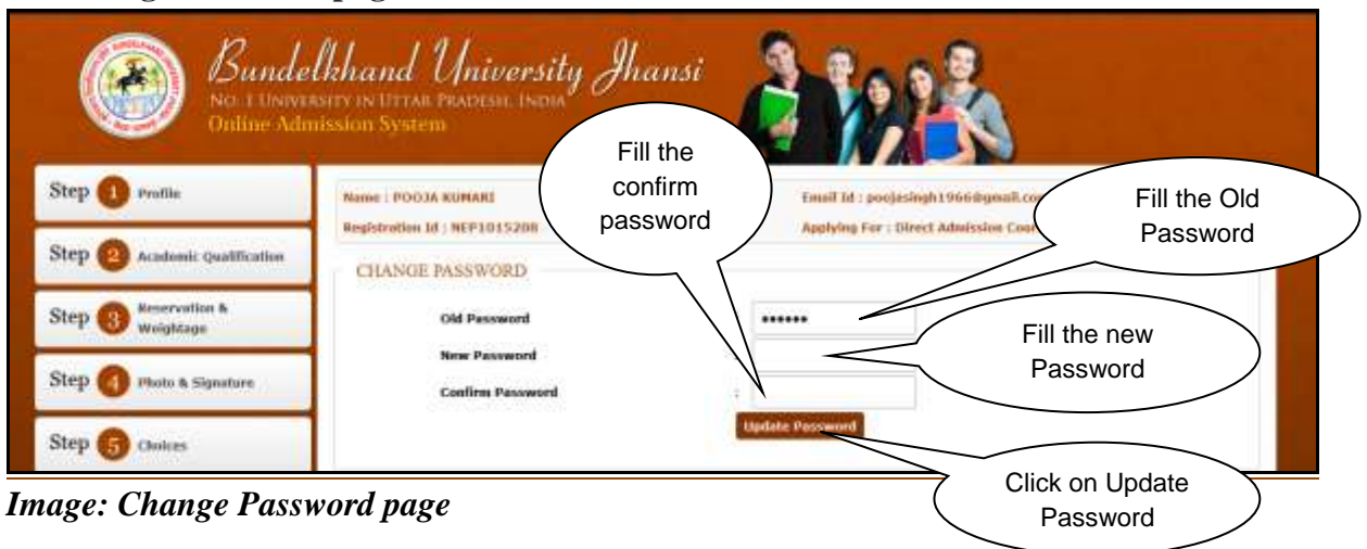
Image: Change Password page