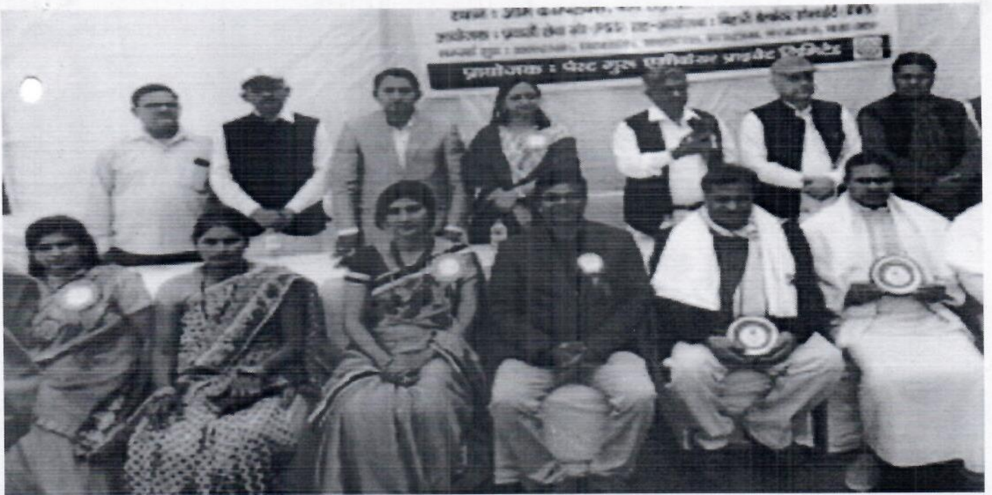
Uplifting the lives of migrant children